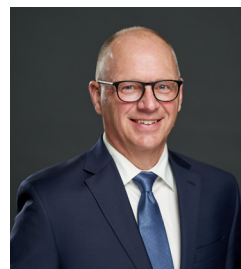
Mayor Scott Gillingham, Ex-Officio