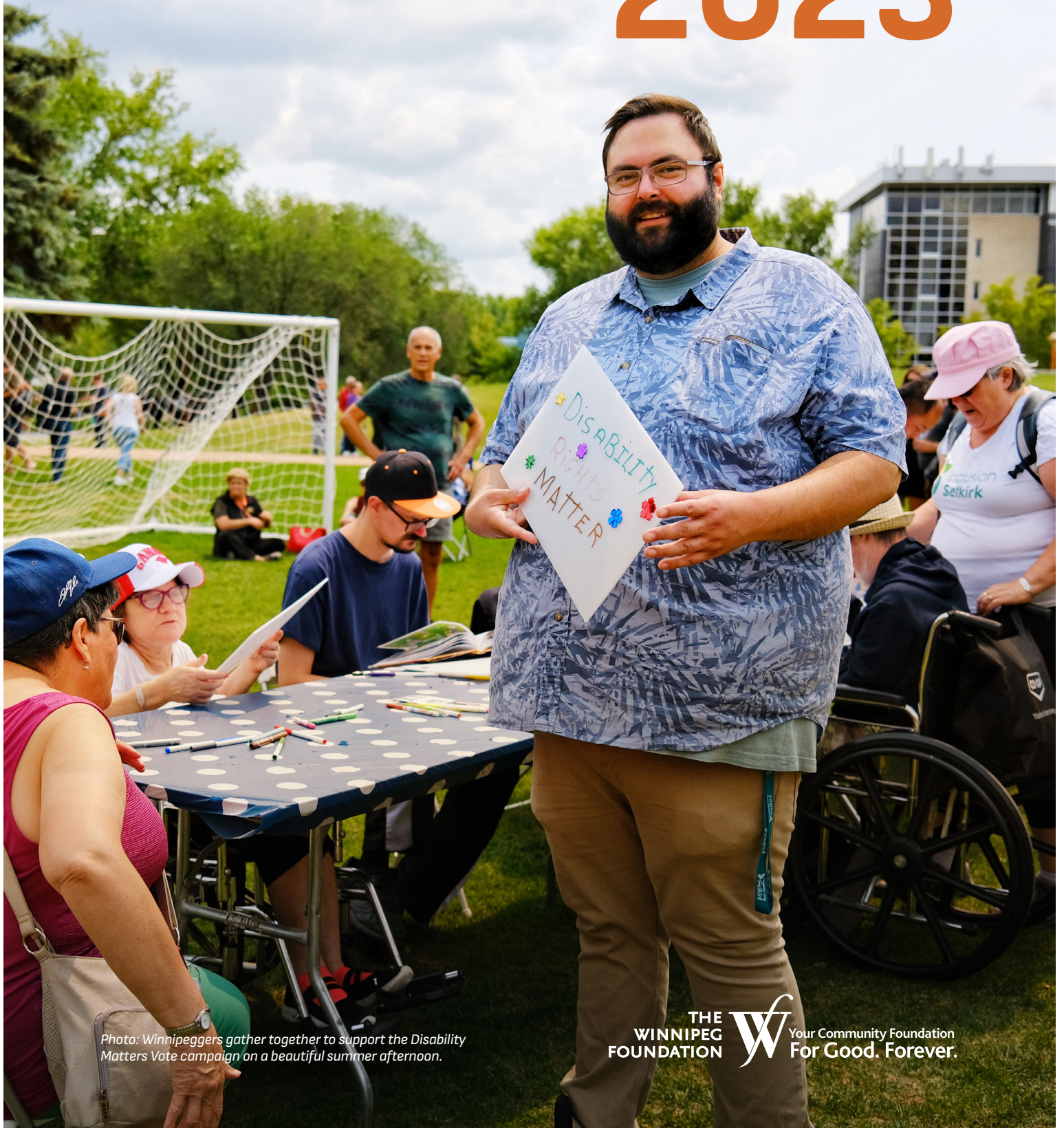
Photo: Winnipeggers gather together to support the Disability Matters Vote campaign on a beautiful summer afternoon.